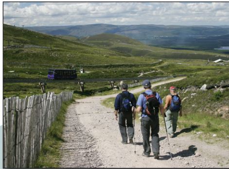
Right: The funicular heads up Cairngorm as a group of walkers heads down.