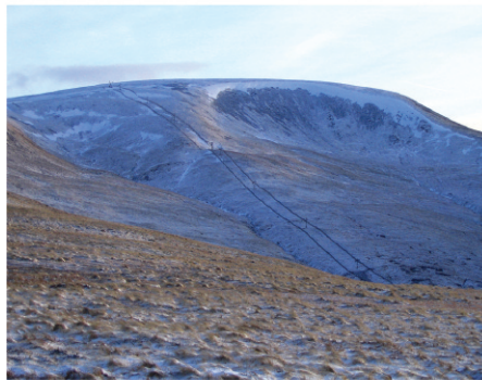
The high bowl of Glas Choire holds a crown headwall of late winter snow on Glas Maol.