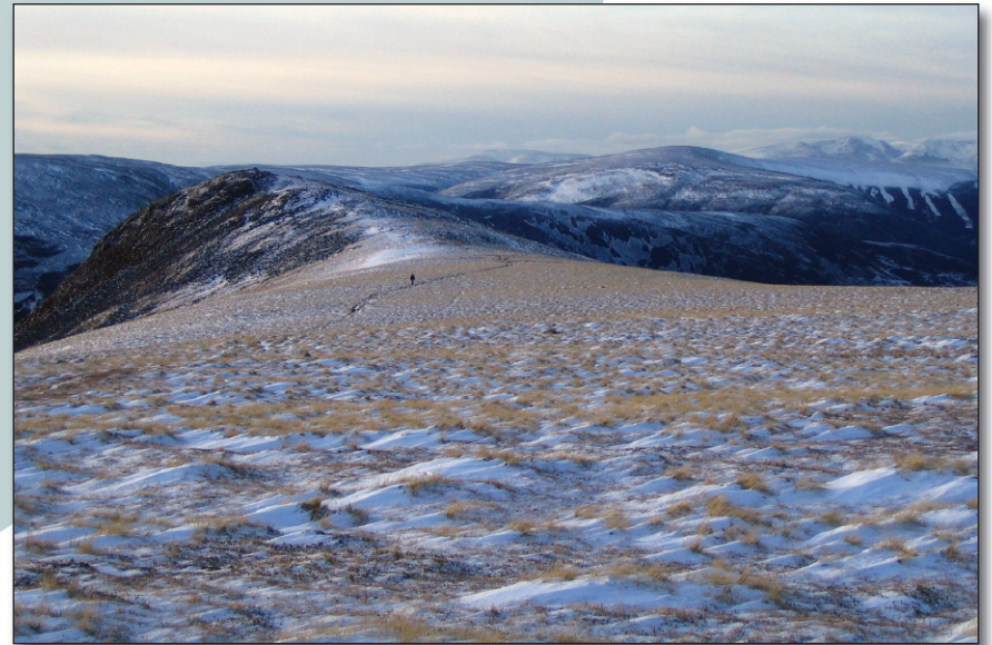
A walker descending the long ridge of Sron na Gaoithe, the northern spur of Glas Maol, that falls to Seann Spittal Bridge in Glen Clunie.