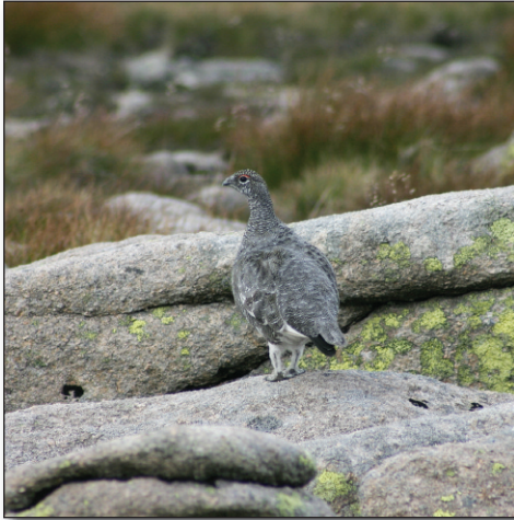
Above left: A male ptarmigan in its summer plumage. In Britain these high altitude birds can only be found on the highest of Scottish mountains.