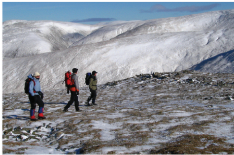
Winter walkers setting out up Glas Maol from the Glenshee ski centre, with the Cam an Tuic hills behind.