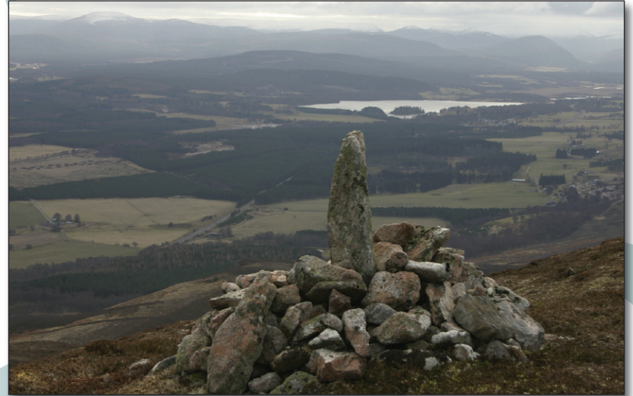
To the west of the River Spey, the Monadh Liath rise above Aviemore. Here on Crag Ghleannain above Lynwilg, a cairn marks the best viewpoint.